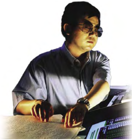
Braille and the Kurzweil Reading Machine, two of the inventions which have bettered the lives of blind and vision impaired people.

One blind person who heard the Walter Cronkite Today Show transmission was Stevie Wonder. Stevie became the first customer and this led to a long-term friendship between the inventor and the blind musician. Kurzweil subsequently brought innovations to computer-based music and is today one of the preferred manufacturers of keyboards and studio equipment.