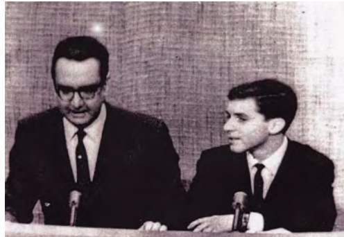
Walter Cronkite (left) and Ray Kurzweil on the Today Show in 1976.

Since then Kurzweil has gone on to introduce the Kurzweil Reader, used extensively by blind people in the USA. His close collaboration with the Nation Federation of the Blind had improved the lives of blind and vision impaired people, providing them with the tools to pursue higher education, employment and personal development. Thank you Ray, we celebrate the gift of your genius. ■