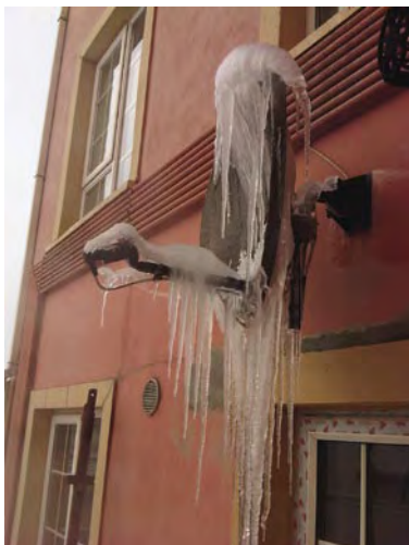
What a Dish! Icicles giving bad reception at the NCBI office in Letterkenny, Co. Donegal.