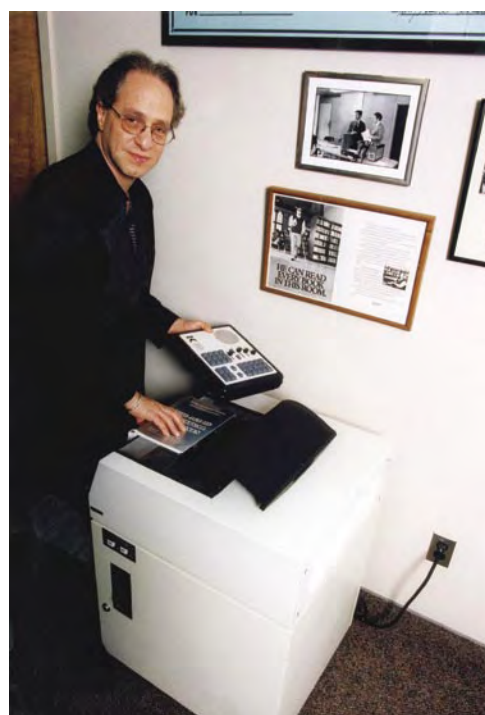
Ray Kurzweil, author, inventor, visionary, who changed the lives of blind and vision impaired people, by opening up a world of opportunities through his wonderful inventions.