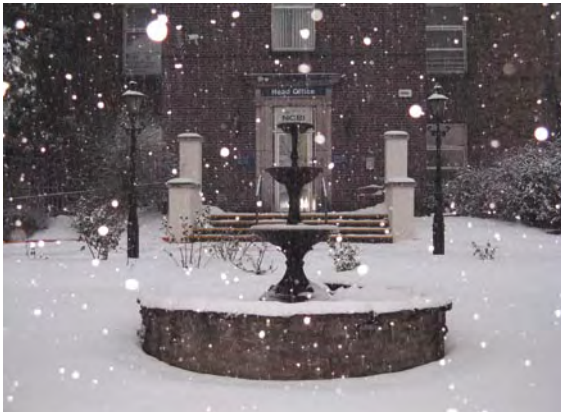
NCBI head office had its seasonal covering of the white stuff.

Ireland has had one of its coldest, snowiest winters on record. The severe weather caused hazardous conditions and made life difficult for many. Let's hope we have seen the last of it!