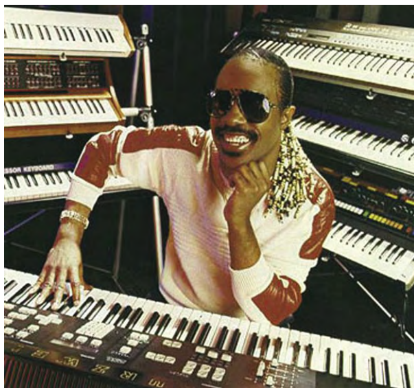
Stevie Wonder, the first customer of the Kurzweil Reading Machine.