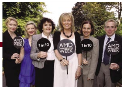
Age-related Macular Degeneration Awareness Week!