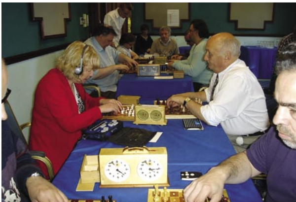
Players competing in the minor event.