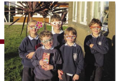
National Spex Day brings Sensory Garden.